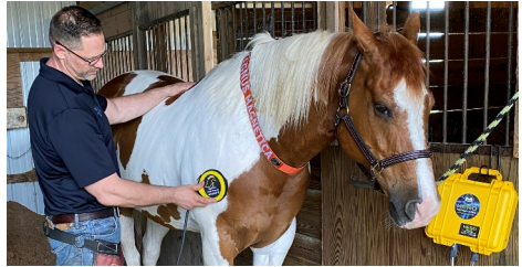
Mag Disc $650.00 in Branded Pouch - $25.00