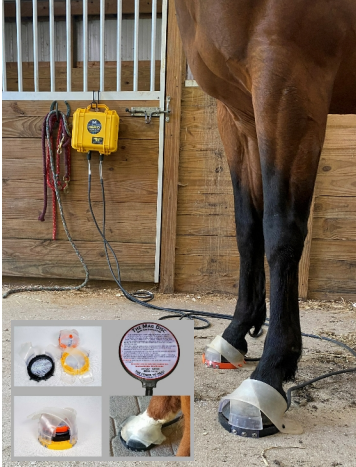
Hoof Pro Bindings - $500.00 Hoof Pro Bundled w/Mag Disc - $1150.00

Optional accessories include Mag Paddle Pro, Mag Discs, Hoof Pro Bindings, White Applicator Wands, HERO Power Bank, OneWrap Velcro Strapping System, Poll Straps, Stall Wall Hanger, HERO Sling Case and more!