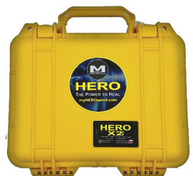
HERO X2 MINI

Magnus Magnetica, LLC 1555 East New Circle Road - Suite 142-214 - Lexington, KY 40509