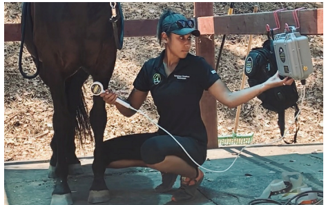
White Wand $195.00 in HERO Sling - $100.00