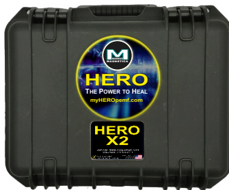
HERO X2 MAXX