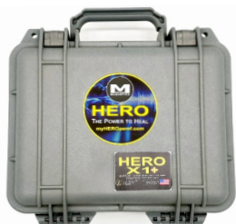
HERO X1 - Starting at $1,995 A Single Output PEMF device.