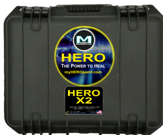
HERO X2 MINI or MAXX - Starting at $2,495 A Dual Output device - apply to two body parts at the same time.