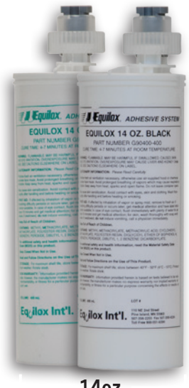
14oz. Side by Side Cartridge