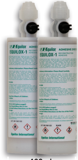
420ml. Now in Black