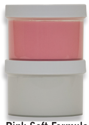
Pink Soft Formula