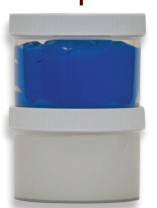
Blue Hard Formula