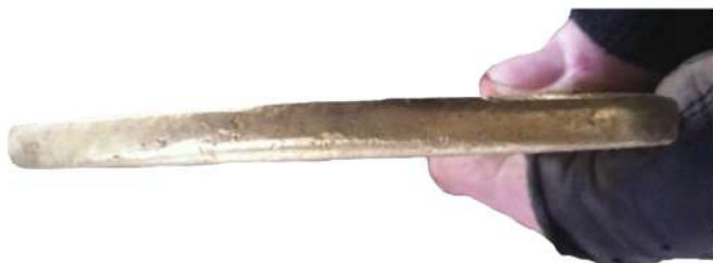
Toe wear at 2nd reset, 13 weeks