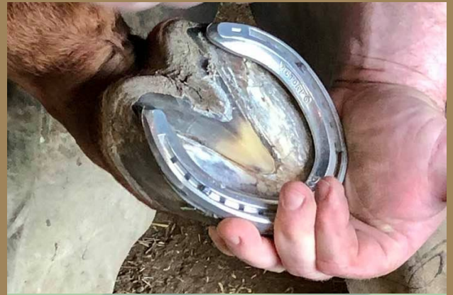
"A Sound Solution"

The Victory Racing Plate Company 1200 Rosedale Avenue • Baltimore, MD 21237 • USA Phone: 410-391-6600 • Toll Free: 1-800-872-7528 victoryracingplate.com • email: vrp@victoryracingplate.com