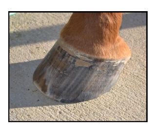
Step 2: Rasp the sides of the hoof where the tabs & blisters will go. Make sure the bottom & sides of the hoof are VERY CLEAN.