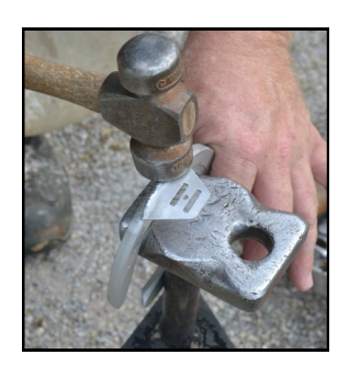
Step 5: Shape the Hanton Horseshoe to fit the hoof (as with any standard shoe), making sure the shoe is flat to the bottom of the hoof.