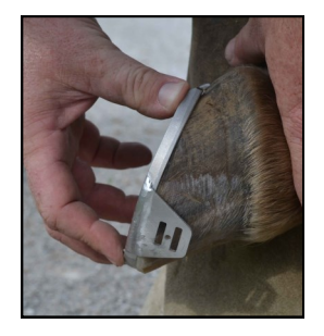
Step 8: Place the shoe on the horse's hoof and set the hoof on the ground with the shoe in place.